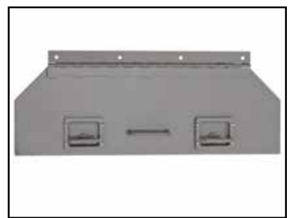
SD70M ELECTRIC FILTER ACCESS DOOR