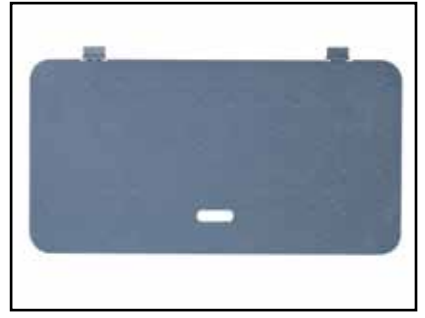
GE BATTERY DOOR