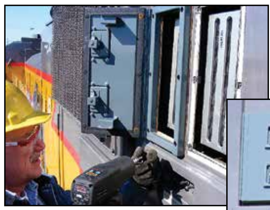
SD70-ACE ELECTRIC FILTER ACCESS DOOR

S nyder's latest advancements in locomotive products