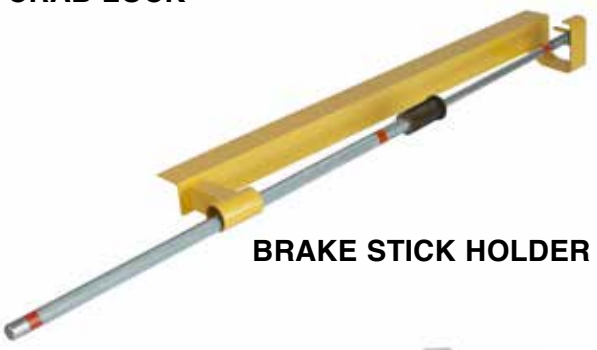
BRAKE STICK HOLDER